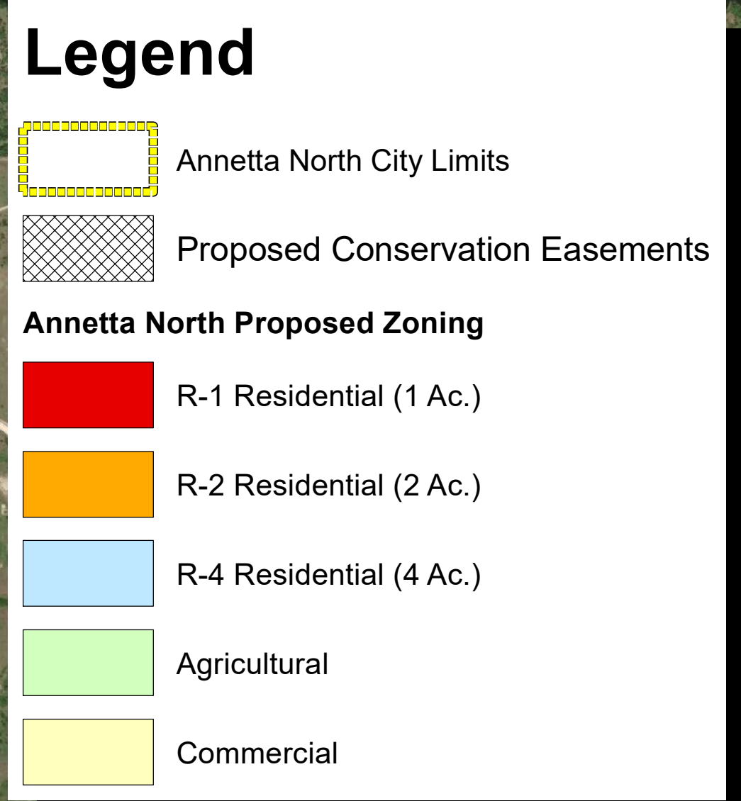
Exhibit 2 Zoning Map